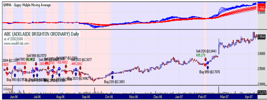
Figure #2. GMMA Signals

The neural networks built in this study were designed to produce an output signal, whose strength was proportional to expected returns in the 5 day timeframe. In essence, the stronger the signal from the neural network, the greater the expectation of return. Signal strength was normalized between 0 and 100.