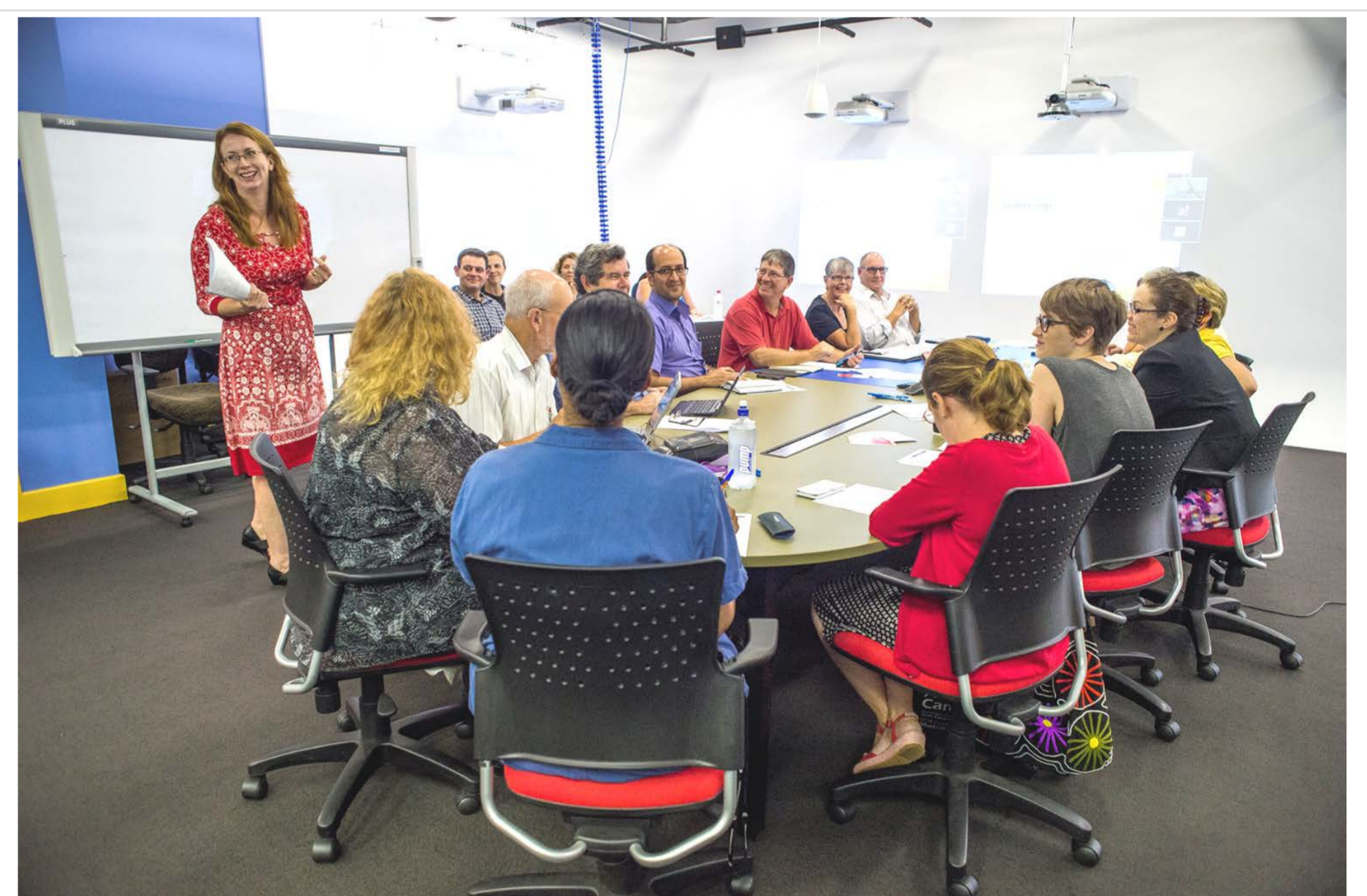
Lunchtime Research Bites session