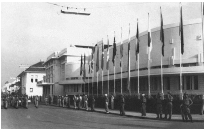
Outside the Bandung Conference venue, Gedung Merdeka (Independence Building), 1955.

The basic principles China upholds in providing foreign assistance are mutual respect, equality, keeping promise, mutual benefits and win-win. 6