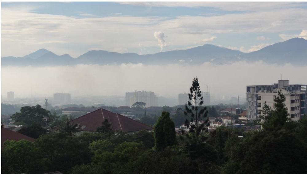
Bandung: A Thriving City Surrounded by Mountains and Volcanoes in West Java 3

The Bandung Conference of 1955 – also known as the Asian-African Conference (Konferensi Asia-Afrika in Indonesian) – has acquired a legendary aura in international relations history. Its spirit of solidarity among newly independent nations in Asia and Africa was breathtaking: never before had non-Western nations come together to seek a voice in world politics.