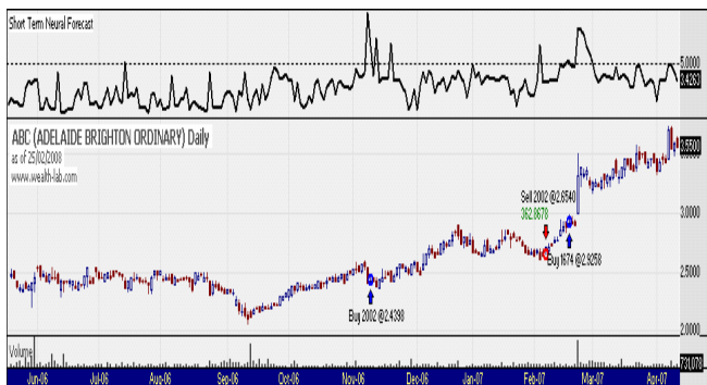
Figure 3 GMMA signals filtered with ANN

Of course the result will not always be that all whipsaws are removed. Rather, only whipsaws which are predictable using the ANN inputs will be removed.