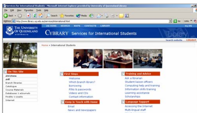
UQ Cybrary web Site for International Students

topics and specific resources, including how to cite materials and evaluate the Internet