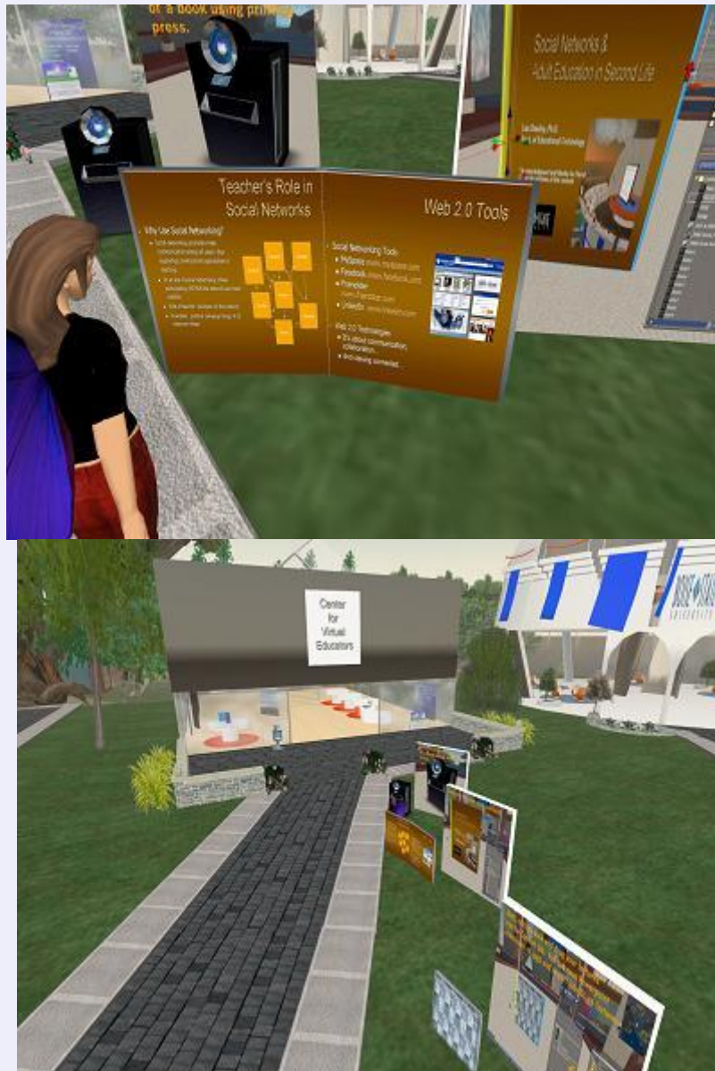
Illustrations showing the avatar of one of the authors exploring an education precinct in Second Life.

The Faculty of Humanities & Social Sciences has indicated that a small number of staff have just started investigating Second Life as an education tool.